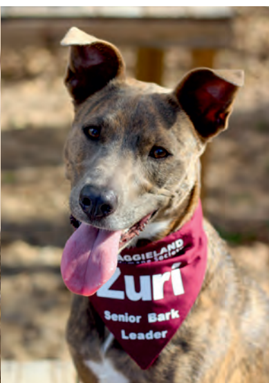
Zuri, raised $1,160