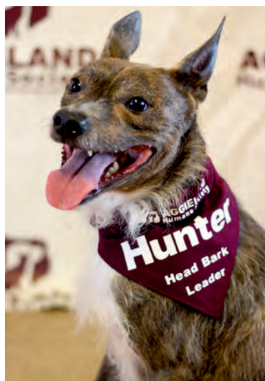
Hunter, raised $1,180