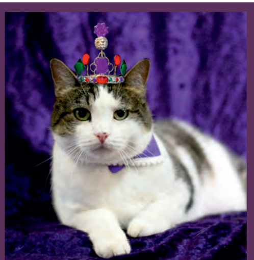
Queen Tiger Lilly raised $1,253.34 in 2020 for pets in need