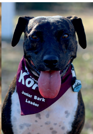
Kora, raised $701