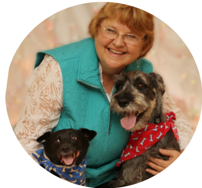
Cover Dog: Graham, a Norwegian Elkhound mix, adopted from AgHS December 2019